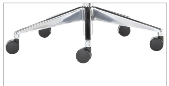
Aluminum 5 Prong Base