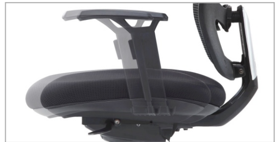
Depth Adjustable Seat Pan