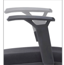
Height Adjustable Armrest