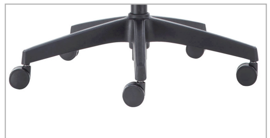
Nylon 5 Prong Base