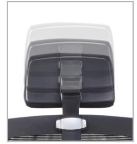
Height Adjustable Headrest