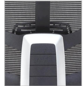
Height Adjustable Lumbar Support